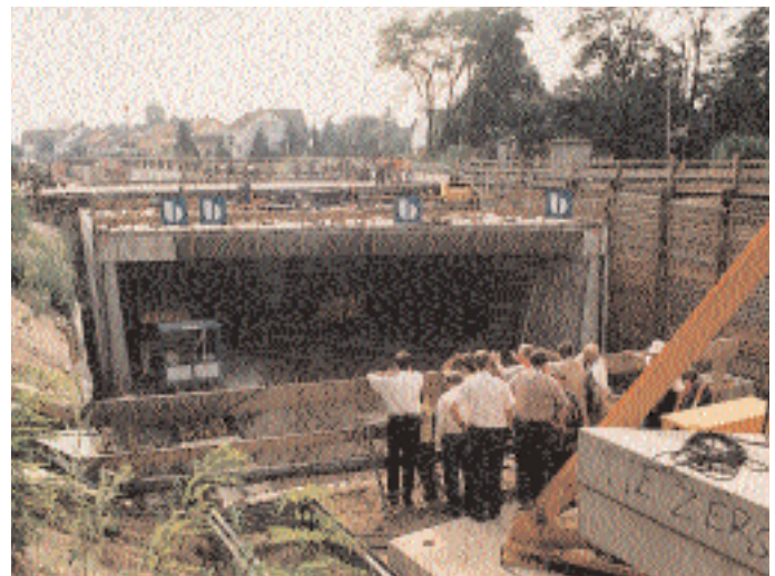
The sliding frame element was prefabricated in a ditch 23 metres away.

and with their help, the movements of the sliding frame were ascertained according to position and height. Controlling the sliding frame was consequently no problem.