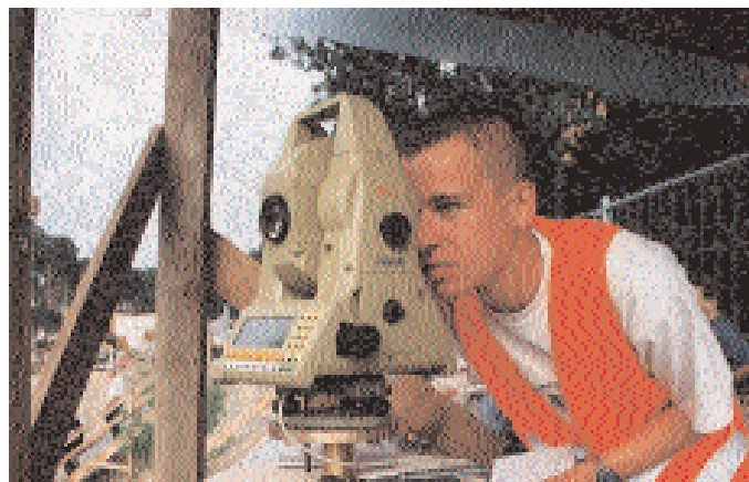
Here the Leica TCA 1800 automatic target recognizing total station is being installed on the surveying column at the site. Computer-controlled and recording to the APS Win measuring programs, it took aim at the miniature prisms without the presence of an observer and determined their current position with great accuracy.

under the tracks until it reached its final position.