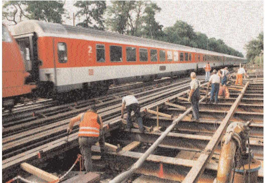
Leica miniature prisms were located at all important surveying points. They are clearly seen here next to the red clamps.

This sliding frame building element was 18 metres wide, 13 metres long, 8 metres high and weighed 2,400 tons. With computer-controlled hydraulic presses having a force of 3,500 tons, it was pushed 23 metres